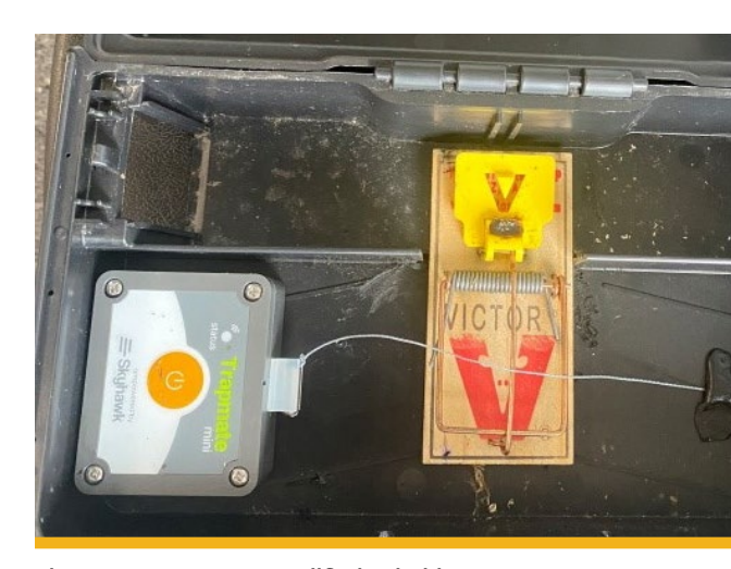
The VM EZ Force trap modified to hold a snap trap

The company proposed a plan to place rodent trap boxes on the roof near the dormers and around the home's exterior perimeter, which the homeowner agreed upon since no rodenticides were to be used due to the customer's concern for pets and wildlife. The technician set all traps with Skyhawk Sensor alerts to avoid unnecessary climbing of ladders to check empty traps. All traps were baited with Pro Pest rodent lure and secured to the roof with Hercules putty. Only one type of snap trap and trap box was used for this control method.